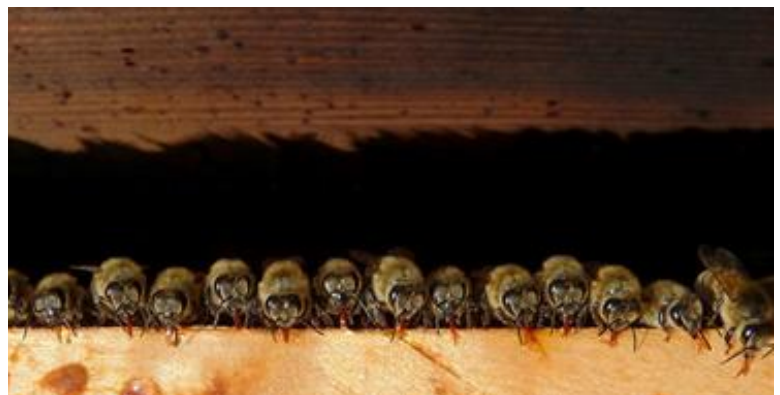
Guard Bees Deployed